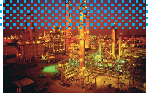
Chemical processing plant

The Promass 83F is used to track true mass flow from a pressurized liquid stream during the filling process of truck tanker and rail tanker cars.