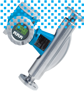
Promass 83F mass flow meter