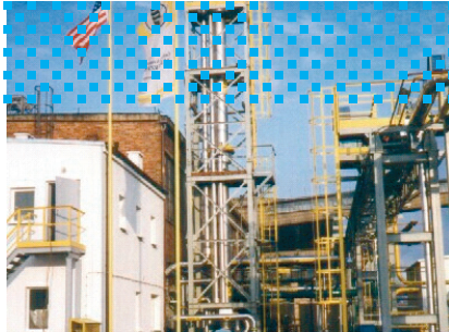
Liquefied carbon dioxide loadout area

Promass 83F Coriolis mass flow meter used to measure sub-zero liquid Carbon Dioxide flow