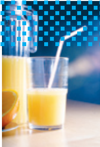
Fresh oranges to fresh juice

PROline Promass 83F is used for Brix measurement in sugar, fruit, and juice industries