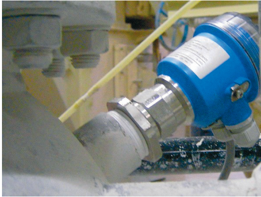
Soliphant T FTM20 mono-rod high level limit switch