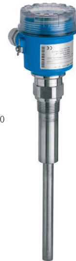
Soliphant T FTM20 mono-rod