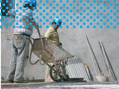
Plaster is used on many construction sites

Soliphant T FTM20 high level detection is not influenced by pneumatic knocker