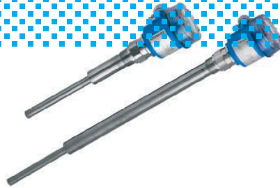
Soliphant T FTM20, FTM21