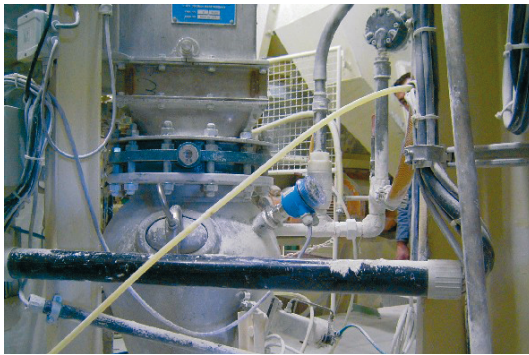
Vessel with pneumatic knocker that helps to discharge vessel