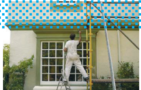
Painting plaster trim on new home

Soliphant T FTM20 is used as a high level detection device to control a conveyor attached to a recycling vessel in a gypsum plant. A pneumatic knocker connected to the vessel does not influence the switch point.