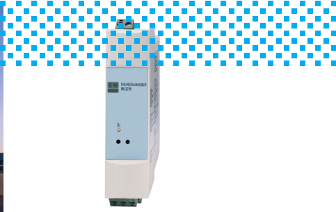
RN221N active barrier and power supply