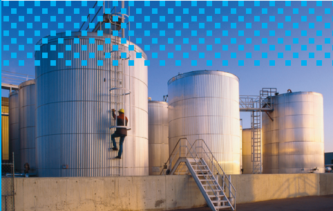
Hazardous chemical storage

RN221N is used as an intrinsically safe barrier and power supply