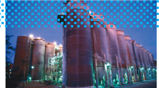
Protection in dust hazardous storage

The RN221N is a FM certified active intrinsically safe barrier with integral power supply for safe isolation of 4 to 20 mA current circuits.